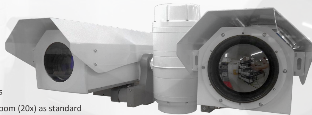
Above: Typical Osiris Ranger (models will vary)

** Johnsons Criteria, (Human at 1.8m x 0.5m, Detection at 2 pixels, Recognition at 8 pixels and Identification at 13 pixels. 50% probability subject to environmental conditions). Based on the JPTX-EVO2-300-W.